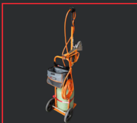
936 GAS BOTTLE TROLLEY