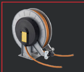
GAS HOSE REEL